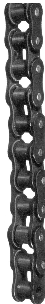
普通链 Normal chains